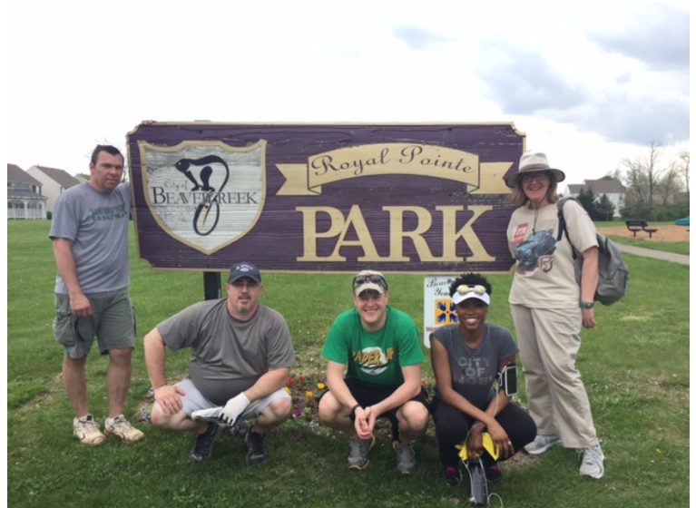
Pictured: Volunteer group helping spruce up your parks.

Are you interested in "adopting a park"? Contact the parks department for information. It is fun, easy and a great team building activity!