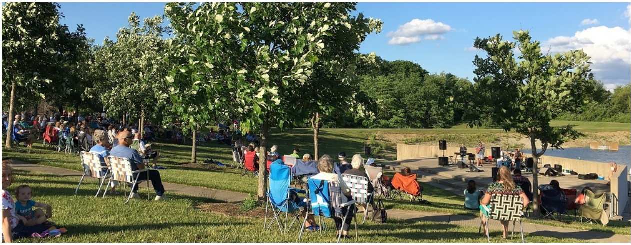
Pictured: Summer Concert Series 2017 - Concerts are Sunday evenings, 7 - 8 p.m. at Dominick Lofino Park, 640 Grange Hall Road beginning June 4.