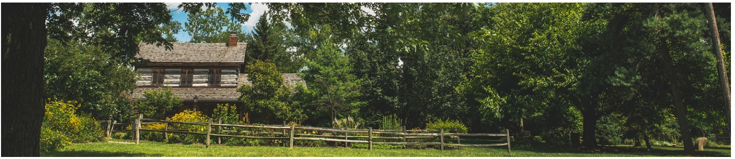
Pictured: Wartinger Park, 3080 Kemp Road.